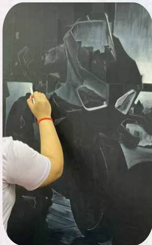
White Glass Marking Pencil